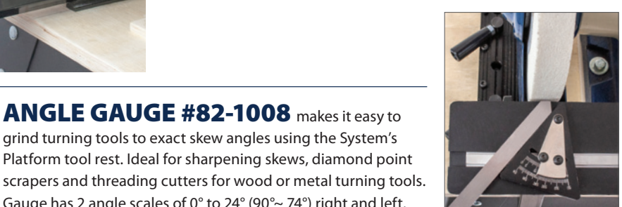
SHARPEN TOOLS AT EXACT ANGLES

holds woodturning gouges for sharpening bevels at consistent, repeatable angles and shape with your bench grinder and the PRO Sharpening System. Adjusts 40°, so setting bevels to grind on your tools is easy. Jig's clamp firmly holds tool shafts 3/16" to 1-3/8" thick and up to 1-9/16" wide. Ideal for sharpening spindle and bowl gouges, roughing gouges, and for maintaining their cutting edges - from simple bevels, to side ground variations, to the traditional fingernail shape. Works for sharpening carving tools, too!