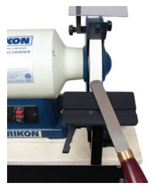
USE PRO SHARPENING SYSTEM'S PLATFORM TO SHARPEN A VARIETY OF BLADES